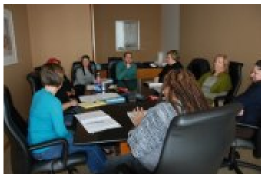
A break-out session.