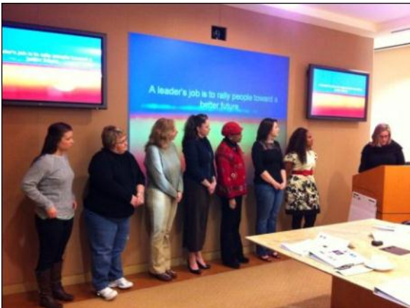
Installation of the newest board members.