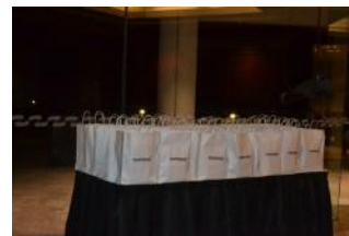
Attendees received goodies from Corporation Service Company, UPS, Newell Rubbermaid, and Cox Communications (not shown).