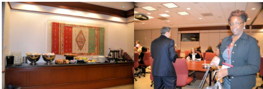
The day begins with a luscious breakfast!

On October 19, GAP held a historic event: Our first Corporate Legal Summit, designed just for the corporate paralegal! The half-day event was hosted by UPS at their Corporate Headquarters, and sponsored by Corporation Service Company (CSC). Paralegals from Georgia's top public and private companies, franchises, and foreign-owned subsidiaries with offices in Atlanta were invited.