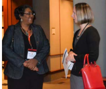
Two attendees enjoy a discussion