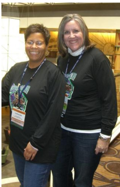
"Blue Jeans for Bison Day" and wearing our Region III shirts.

I attended the "First Timers' Meeting" at 7:30am. This was a wonderful opportunity to meet new people, learn about the policy meeting, and meet the current NFPA® board. Immediately following this meeting were the region meetings.